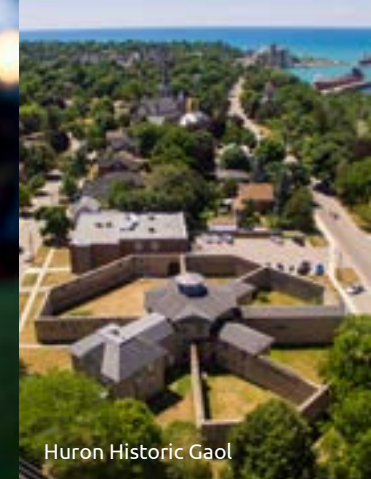
Huron Historic Gaol