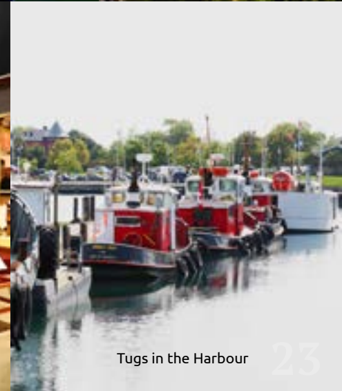
Tugs in the Harbour