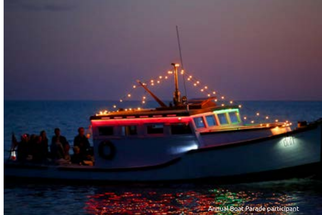
Annual Boat Parade participant