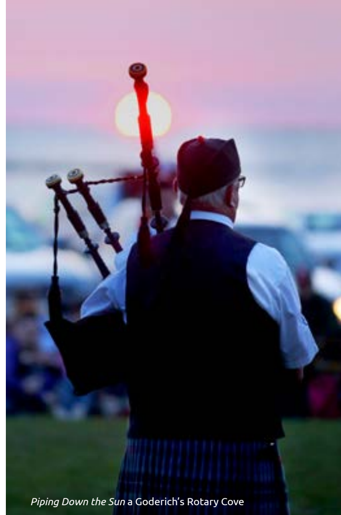
Piping Down the Sun a Goderich's Rotary Cove

The Huron County Museum is located in Goderich at 110 North Street and features exhibitions depicting early settlement, agriculture, military and main street galleries. The Huron Historic Gaol is a National Historic Site that is located at 181 Victoria St. N. This unique octagonal building served as the County Jail from 1841- 1972. At the time of construction it was viewed as a model of humanitarian prison design.