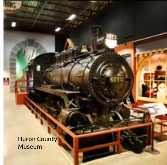
Huron County Museum