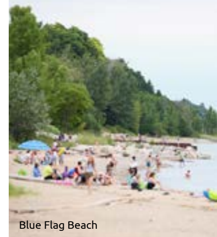
Blue Flag Beach

Bayfield takes great pride in their Blue Flag Beach and Marina. Local individuals and organizations participate in multiple beach, park and river clean up events throughout the year ensuring that the lake shore and village are spotless year round!