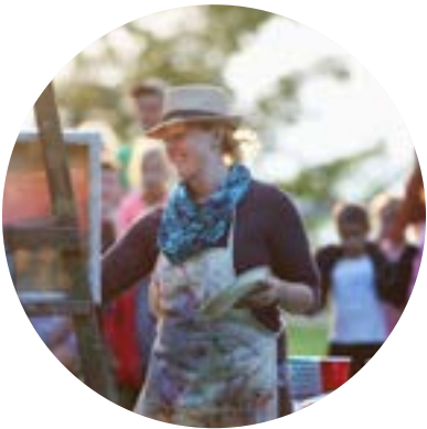
Top: "Captain Harry" Bottom: Paint the Sunset event in Pioneer Park

Purchased by the community in 2016 the Bayfield River Flats is Bayfield's newest natural attraction offering access to the Bayfield River! Be sure to explore all of the Bayfield River Valley Trails!