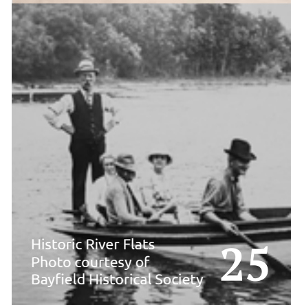
Historic River Flats